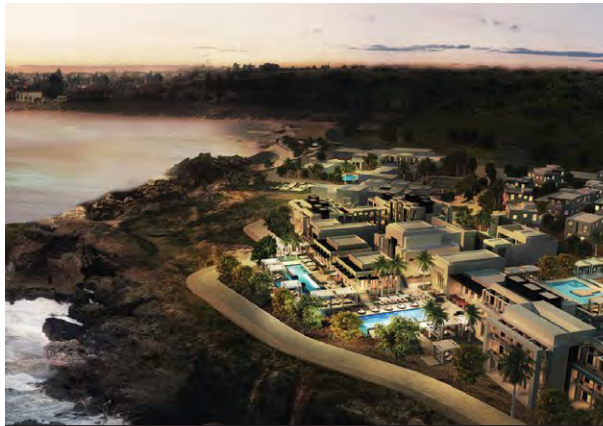
Arzana Resort Rabat, Morocco Hospitality - Mixed Use