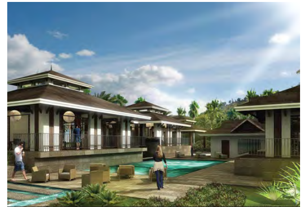
Canopy by Hilton Anse A la Mouche, Seychelles Asset Management