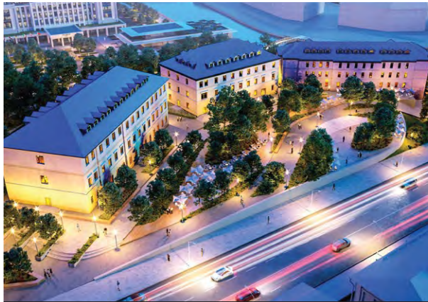
thelocal Apartments Minsk, Belarus Asset Management