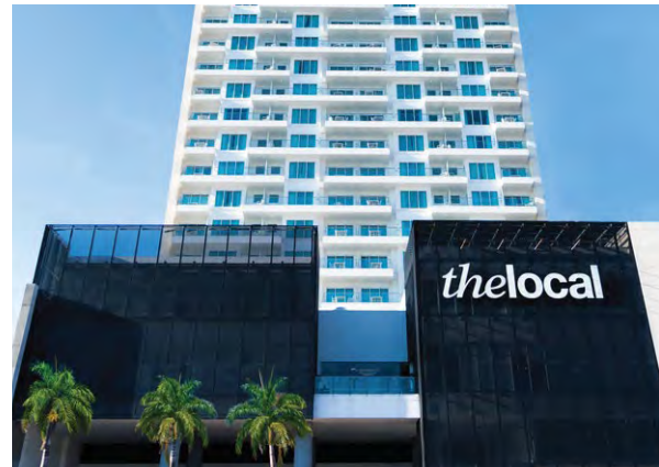
thelocal Hotel Mazatlan, Mexico Asset Management