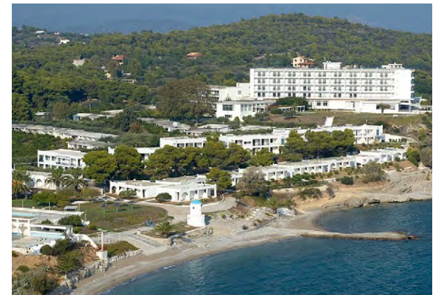
Scarlet Beach Resort, Greece Hospitality