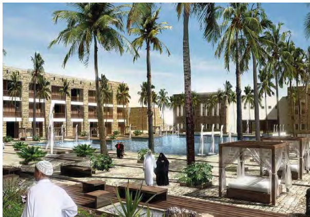
Wadi Rum Hotel, Jordan Hospitality