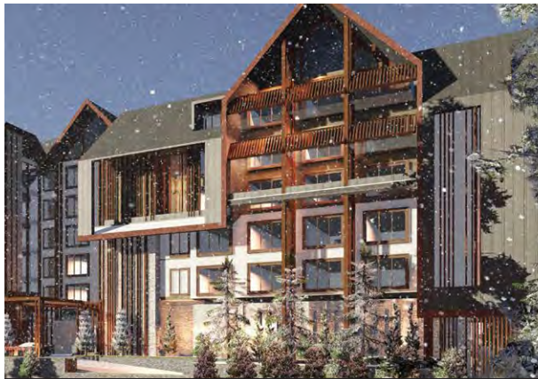
Viceroy Kopaonik Ski Resort, Serbia Asset Management