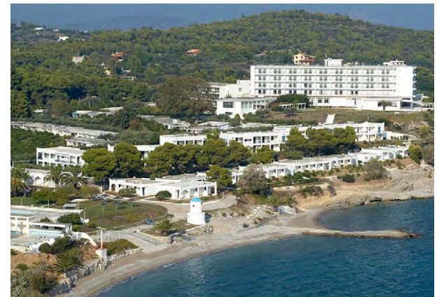
Scarlet Beach Resort, Greece Asset Management