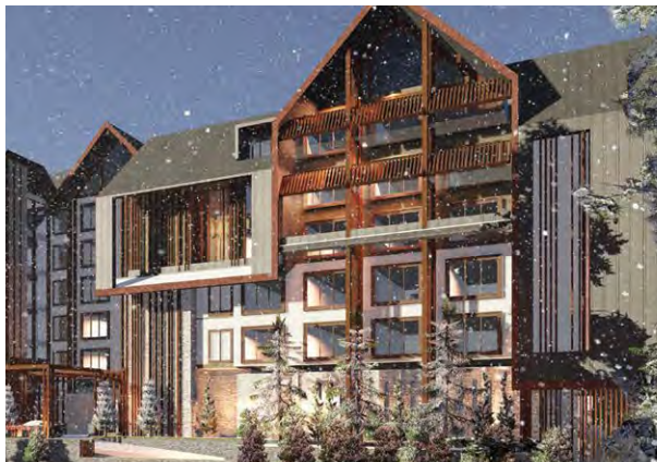
Kopaonik Ski Resort, Serbia Hospitality