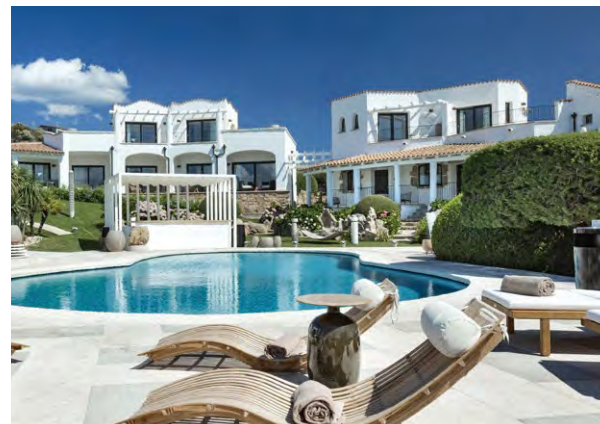
thelocal Hotel Porto Rotondo Sardinia, Italy Asset Management