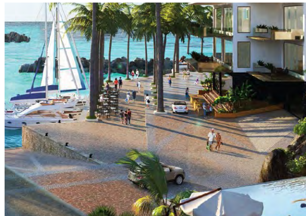
Police Bay Mahe, Seychelles Hospitality