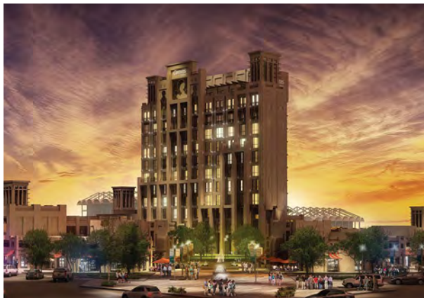
thelocal Hotel Grozny, Chechnya Asset Management