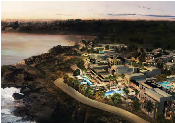
Conrad Arzana Resort, Morocco Asset Management