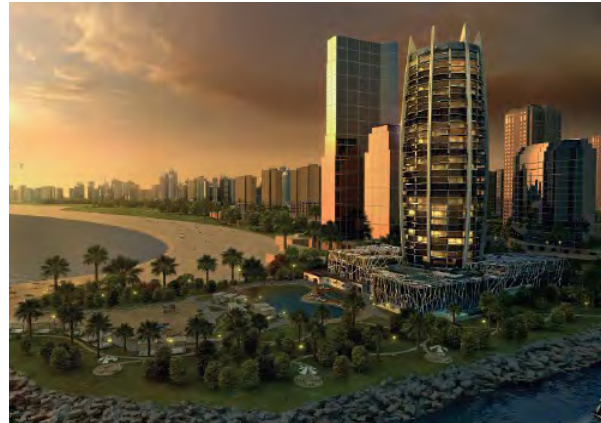
Falcon Tower Hotel Dubai, UAE Hospitality - Mixed Use