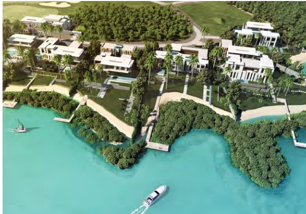
Les Demeures Resort, Mauritius Hospitality