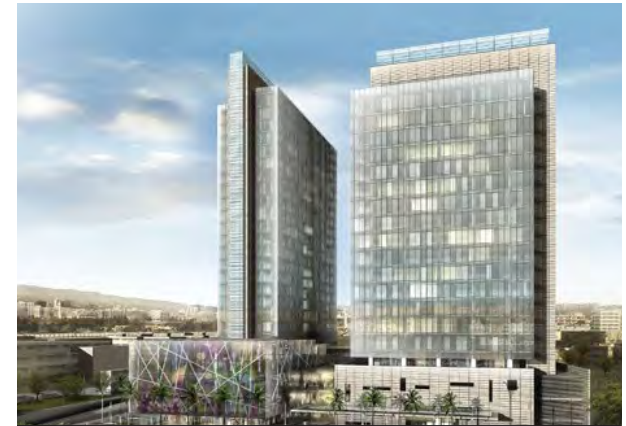
Damascus Hotel, Syria Hospitality - Mixed Use