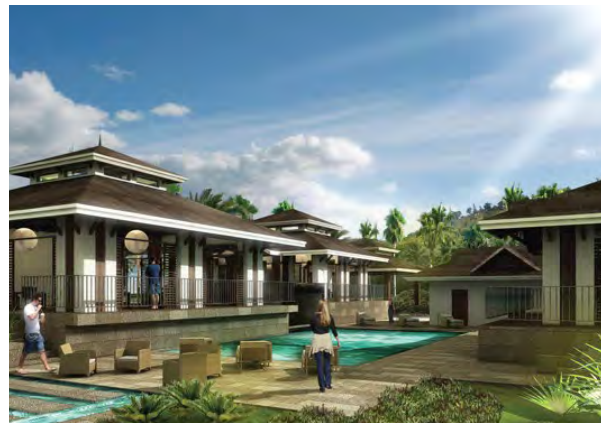
Anse A la Mouche Mahe, Seychelles Hospitality - Mixed Use