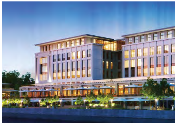
Waldorf Astoria Minsk, Belarus Asset Management