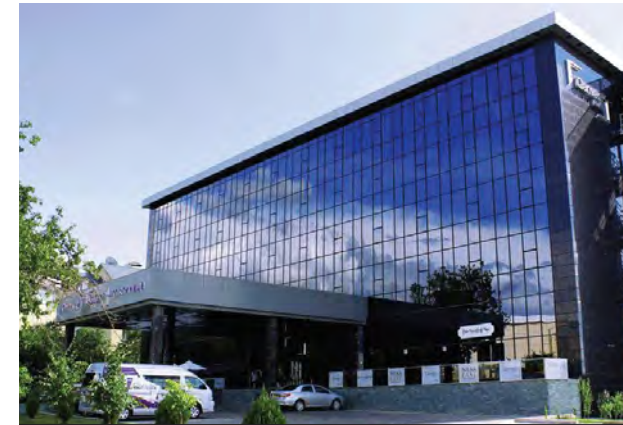
Canvas Hotel Shymkent, Kazakhstan Asset Management