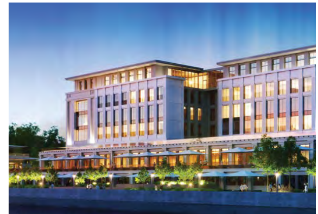
Grand Minsk Hotel Minsk, Belarus Hospitality - Mixed Use