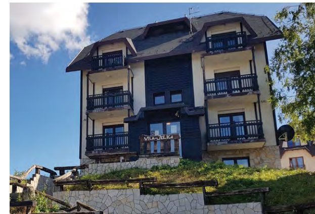
thelocal Apartments Kopaonik, Serbia Asset Management