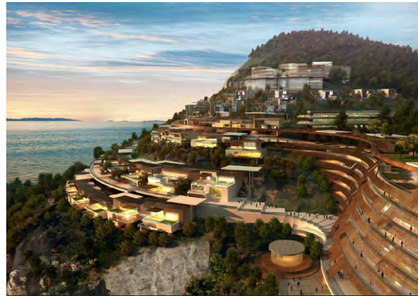
Queens Beach Canj, Montenegro Hospitality